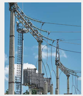
Power Line Inspection